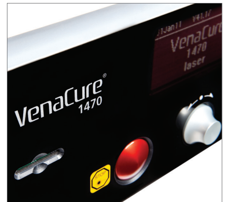
Heats the Vein Wall to Ablation Temperature Faster

AngioDynamics is one of the few vein treatment companies to manufacture the laser and fiber components. The VenaCure 1470 nm laser is hand-crafted in AngioDynamics' manufacturing facility. Our proven track record of reliability allows us to offer an industry-leading 3-year warranty to ensure the highest quality laser and service. Every laser endures a rigorous testing process throughout assembly and upon completion. Ablate veins with the confidence that AngioDynamics' equipment is the highest quality available on the market.